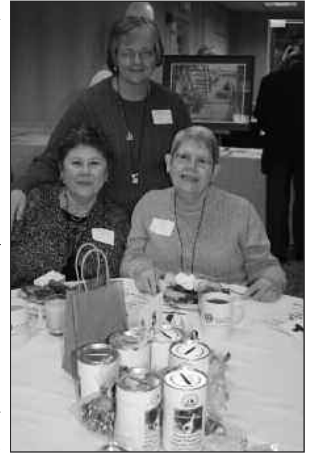
Paddy O'Paws party goers at the 2011 event.

Come bid on hundreds of incredible items in the silent auction including gift certificates for concerts, services, restaurants, lodging, recreation, museums